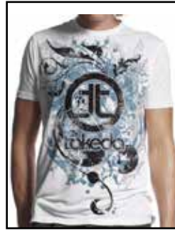
P/N: TP-7004T M P/N: TP-7005T L P/N: TP-7006T XL P/N: TP-7007T 2XL