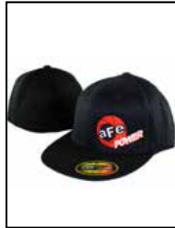
aFe POWER Fitted Hat

P/N: 40-10115 (7-1/4 - 7-5/8) 40-10114 (6-7/8 - 7-1/4)