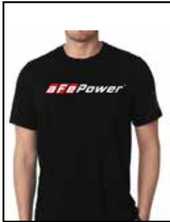
aFe POWER T-Shirt

P/N: 40-30441-B (S) 40-30442-B (M) 40-30443-B (L) 40-30444-B (XL) 40-30445-B (2XL)