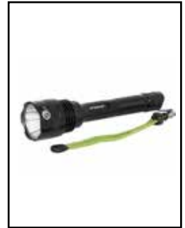
aFe POWER Flashlight