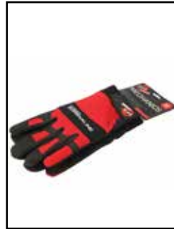
aFe POWER Gloves

P/N: 40-10115 (7-1/4 - 7-5/8) 40-10114 (6-7/8 - 7-1/4)