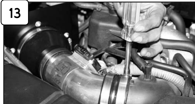
13 Tighten all clamps using 5/16" nut driver.