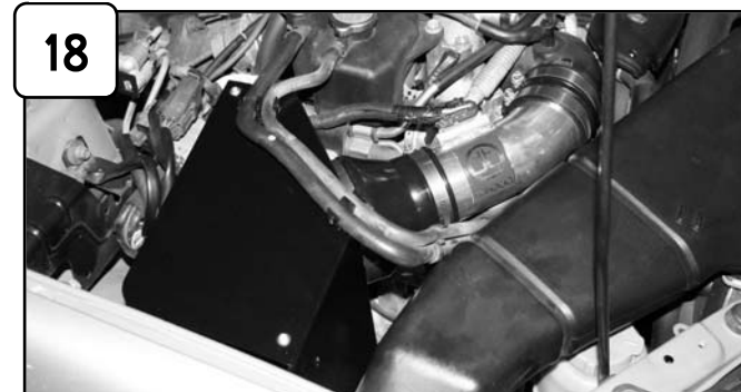
18 The installation of your Takeda performance intake is now complete. Please check all components and re-tighten if necessary. Thank you for choosing Takeda!