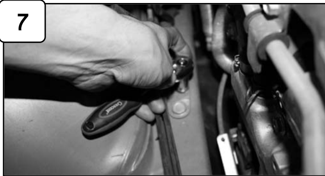
7 With 12mm socket or wrench loosen the bolt on frame and save for install of housing tab.