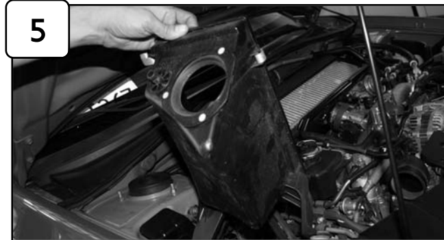
5 With 12mm socket or wrench, loosen the 2 bolts securing bottom half of air box and remove.