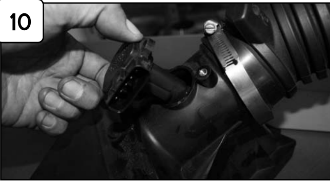
10 Remove MAF sensor from stock intake.

Pro Dry S™ cleaning: see cleaning instruction sheet TF-9000I.