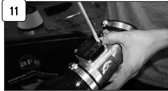
11 Install MAF sensor on intake tube using M4 screws provided. Attach couplers with clamps to intake tube.