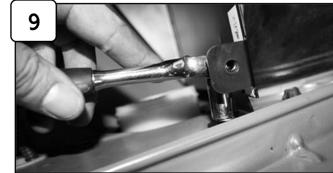
9 With screw and washer provided, tighten top of housing tab to inside of fender using 10mm socket or wrench.