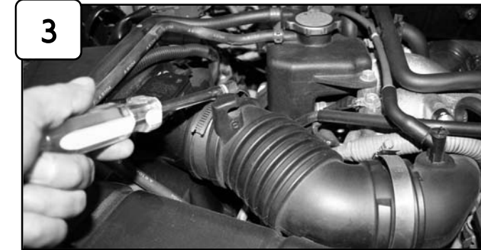
3 Disconnect MAF sensor. Loosen clamps on intake tube using 5/16" nut driver.