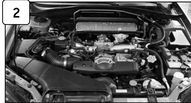
2 Complete Stock intake. Please disconnect battery terminals before installation.