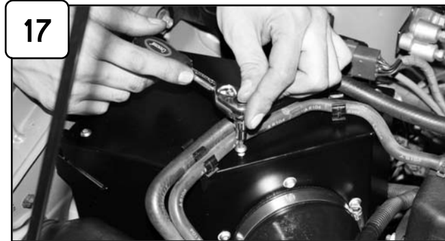
17 Install cover and tighten using 4mm allen key. Attach vacuum lines to cover tabs.