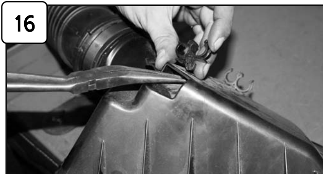
16 Remove clips from upper half of air box. Attach onto new cover.