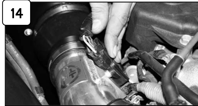
14 Re-connect MAF sensor harness.