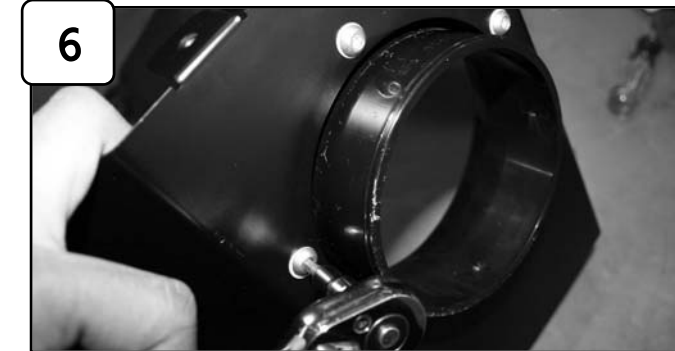
6 Install filter adaptor to housing using supplied button head screws and wavy washers. Tighten using 4mm allen key.