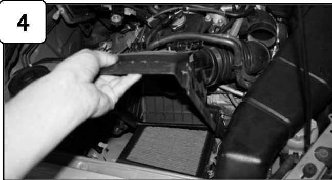
4 Pull back vacuum lines on top of air box. Remove upper half of air box with intake tube.