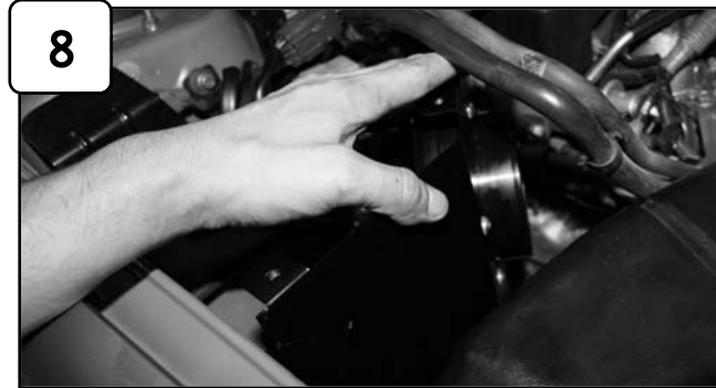
8 Install housing into vehicle and position tab to frame and bolt from step 7. Tighten using 12mm socket or wrench.