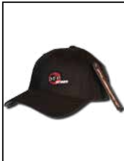
aFe Power Hat