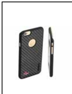
aFe Cell Phone Case