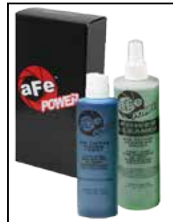
Blue Squeeze Restore Kit