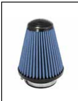
Pro 5R Air Filter