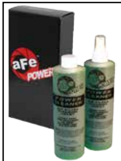
Pro DRY S Restore Kit