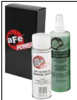
Blue Aerosol Restore Kit