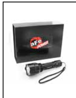
aFe LED Flashlight