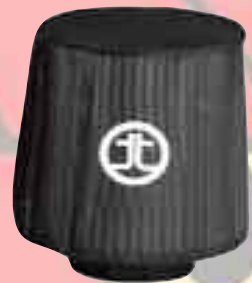
Pre Filter P/N: TP-7011B

Note: Filter Cleaning: When cleaning your Pro Dry S™ filter, be sure to use only "Restore Kit" (Takeda P/N: TP-7016C Pro Dry S™ cleaner only.)