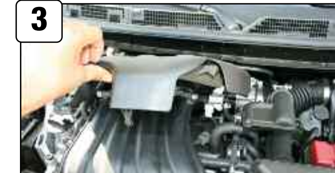
Pull up on the engine cover and remove.