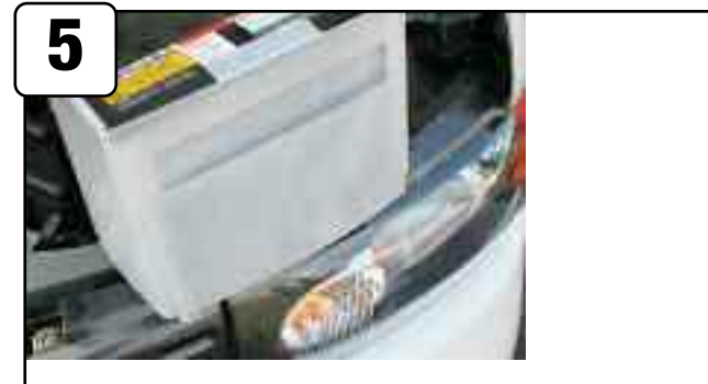
Disconnect battery terminals and remove battery.