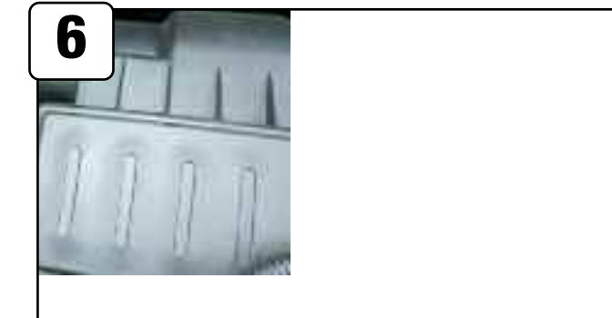
Disconnect the MAS sensor.