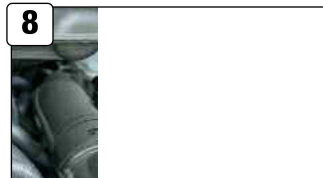
Disconnect the crank case vent line with pliers.