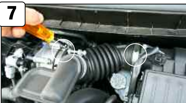
Using a 5/16" nut driver, loosen both intake tube clamps circled.