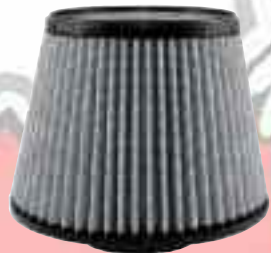
Replacement Filter P/N: TF-9011D