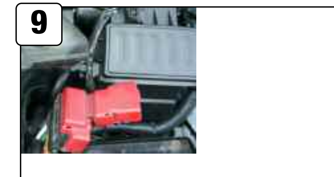
Remove the stock intake tube.