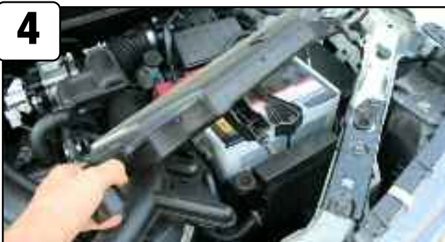
Remove stock resonance chamber.