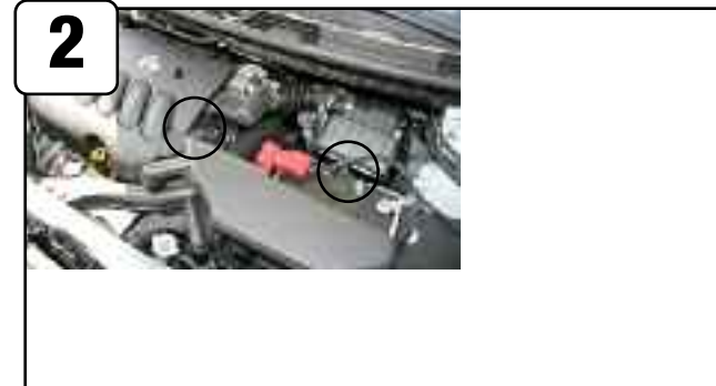
Complete Stock intake. Remove two screws holding the engine cover into place.