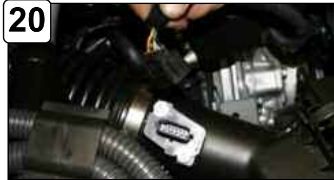
20 Disconnect MAF sensor harness.