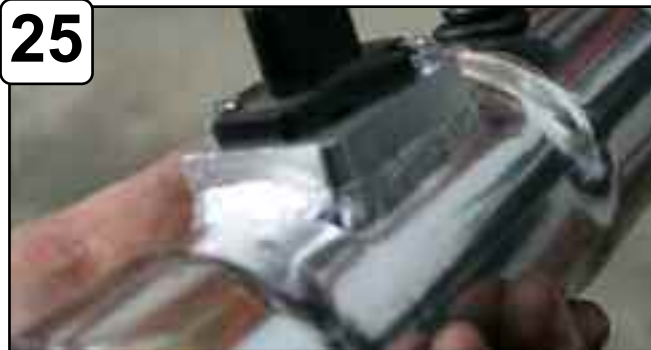
25 Remove MAF sensor from stock air box. Install into new tube with M4 screws provided and tighten using flat head screwdriver. Install rubber grommet to tube provided.