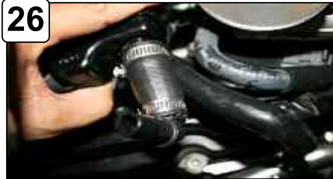
26 With 3"L 5/8" hose, 1/2" plastic elbow & mini clamps provided tighten at end of hose. Attach other end of hose to vent box with mini clamp and tighten. Make sure 1/2" elbow is facing up under intake tube side. see step 29