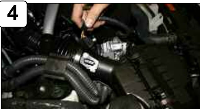
Disconnect MAF sensor harness.