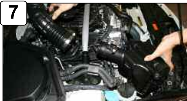
Remove complete intake out of vehicle.