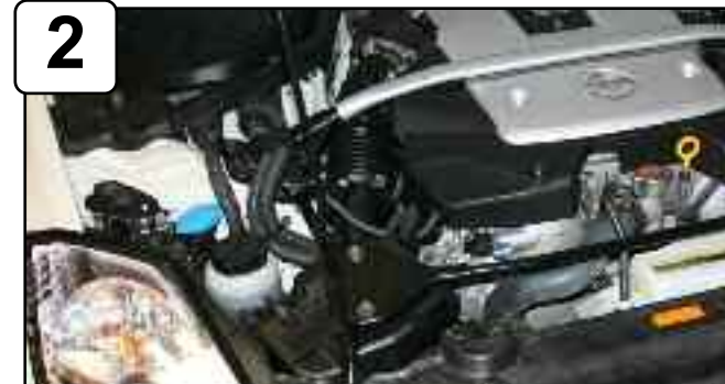
Complete Stock passenger intake. Please disconnect battery terminals before installation.