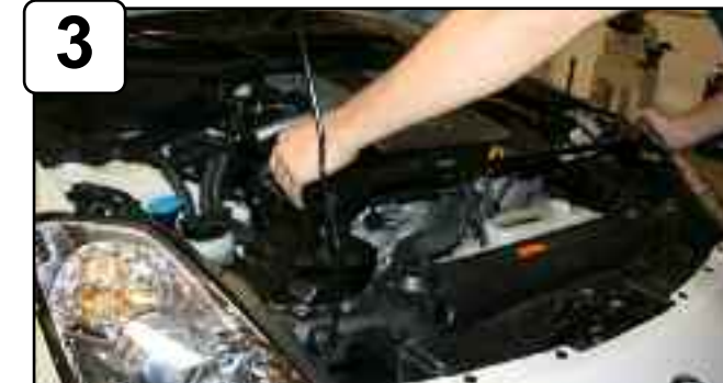
NISMO 350Z only , remove front strut brace before installation.