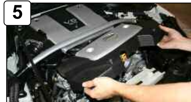
With 10mm socket or wrench, loosen the 5 bolts holding in engine cover and remove.