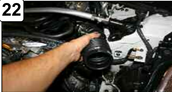
22 Remove complete intake out of vehicle.