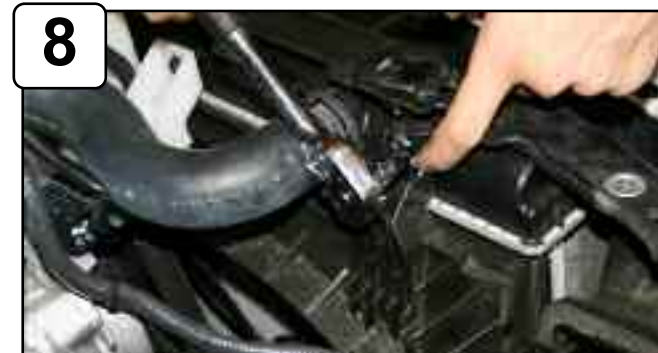
Loosen bolt holding in radiator fan bracket with 10mm socket or wrench. (To be used in step 9C.)