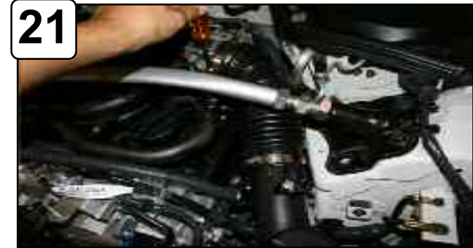
21 Loosen clamps using 5/16" nut driver. Pull back stock intake tube from vent box.