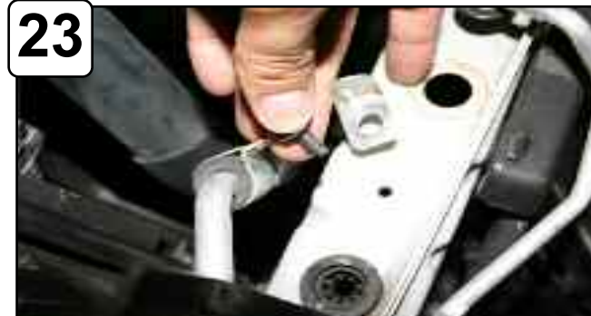
23 Loosen bolt holding in radiator fan & A/C bracket with 10mm socket or wrench. (To be used in step 24A) Loosen bolt holding in radiator fan bracket with 10mm socket or wrench.(To be used in step 24C.)