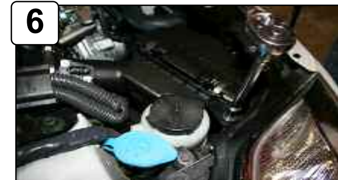
Loosen clamps using 5/16" nut driver. Loosen bolt holding in tube with 10mm socket or wrench. Pull back crank case line from vent box.