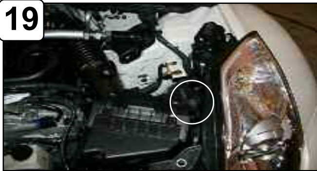
19 With 10mm socket or wrench, loosen the bolt holding in air box.