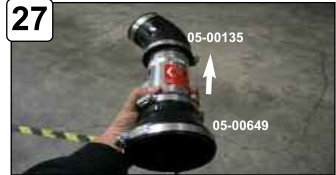
27 With couplers and clamps provided, attach to tube. Arrow direction on tube points towards throttle body!