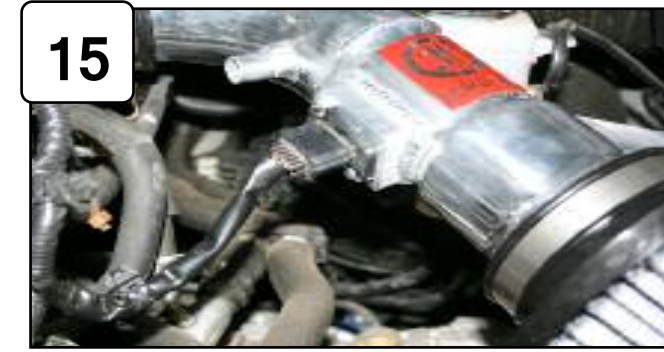
15 Re-connect MAF sensor harness.