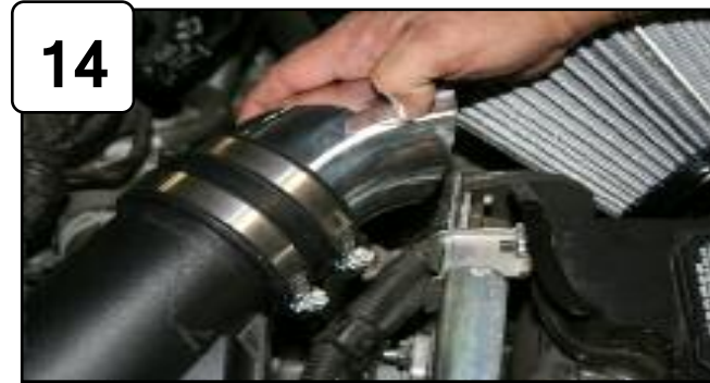
14 Install cold air duct using coupler with clamps provided. Using screw, nut and washer provided, tighten tab on duct to bracket using 10mm socket or wrench. Tighten clamps using 5/16" nut driver.