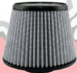
Replacement Filter P/N: TF-9004D