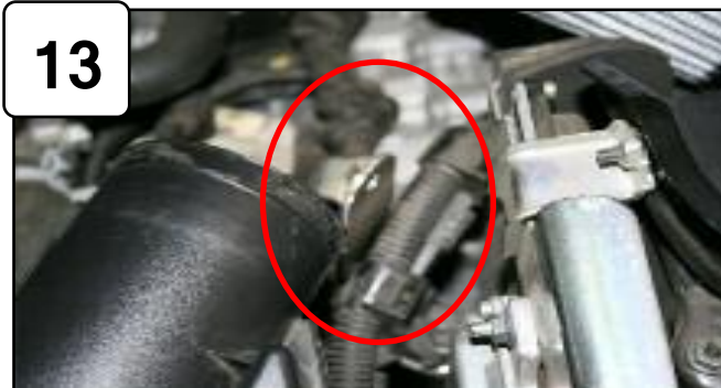
13 Now install bracket and secure with screw from step 12 and tighten.