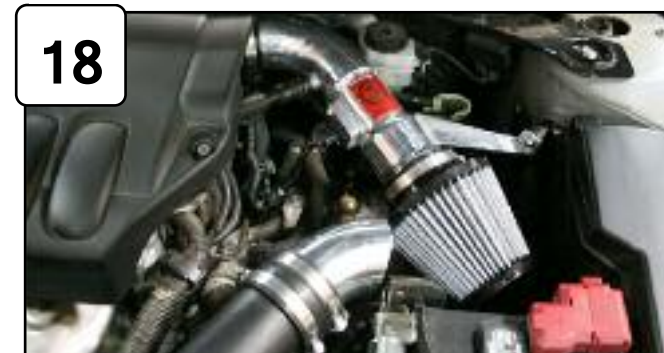
18 The installation of your Takeda performance intake is now complete. Please check all components and re-tighten if necessary. Thank you for choosing Takeda!