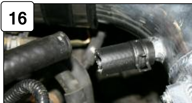
16 Install 5/8" hose provided to intake tube with factory clamp.