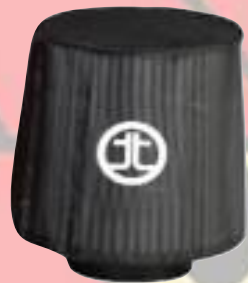
Pre Filter P/N: TP-7011B

Note: Filter Cleaning: When cleaning your Pro Dry S™ filter, be sure to use only "Restore Kit" (Takeda P/N: TP-7015C Pro Dry S™ cleaner only.)