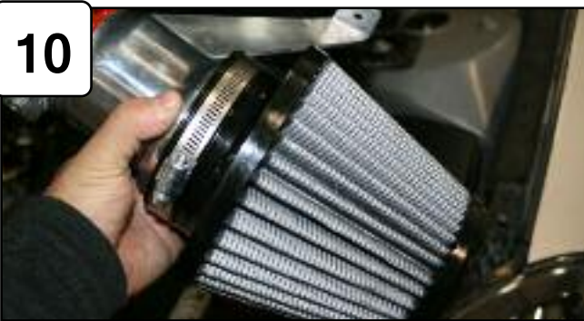
10 Attach air filter to intake tube and tighten clamp using 5/16" nut driver.

Pro Dry S™ cleaning: see cleaning instruction sheet TF-9000I.