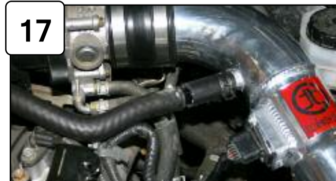
17 Connect factory and new hose together using provided 5/8" barb fitting. Re-connect battery terminals. Re-install engine cover.