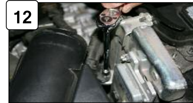
12 Loosen screw holding ECU wire harness. See step 13.