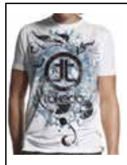
Takeda Grundge Tee

P/N: TP-7004T MED TP-7005T LRG TP-7006T XLG TP-7007T 2XL