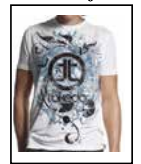
P/N: TP-7004T MED TP-7005T LRG TP-7006T XLG TP-7007T 2XL