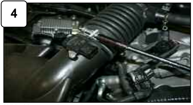
With 10mm socket and ratchet, loosen the two clamps using a 10mm socket or wrench from the OEM intake tube and airbox. Disconnect MAF sensor harness.