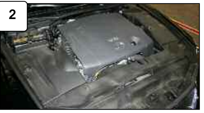
Complete Stock intake. Please disconnect battery terminals before installation.