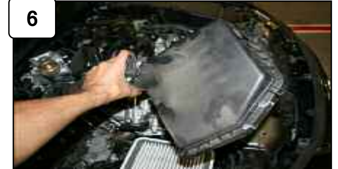
Carefully remove stock air box assembly out of vehicle.