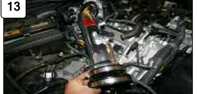
Install intake tube with couplers and clamps provided. Do not tighten.