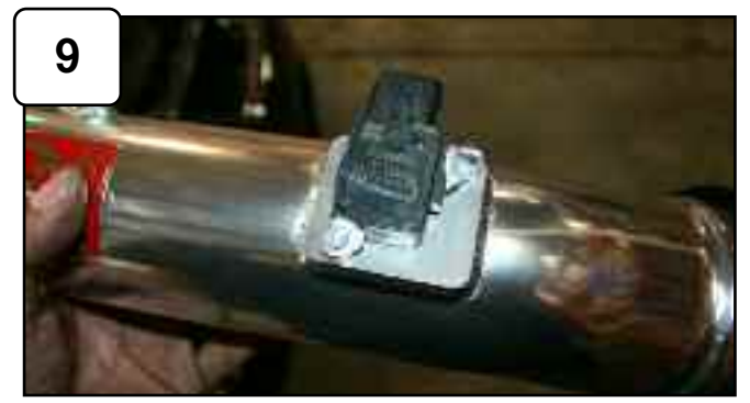
With provided M4 screws, install MAF sensor to new intake tube.