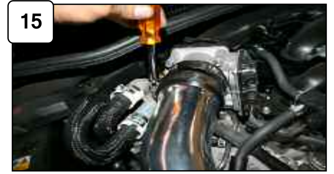
Tighten all clamps using 5/16" nut driver.