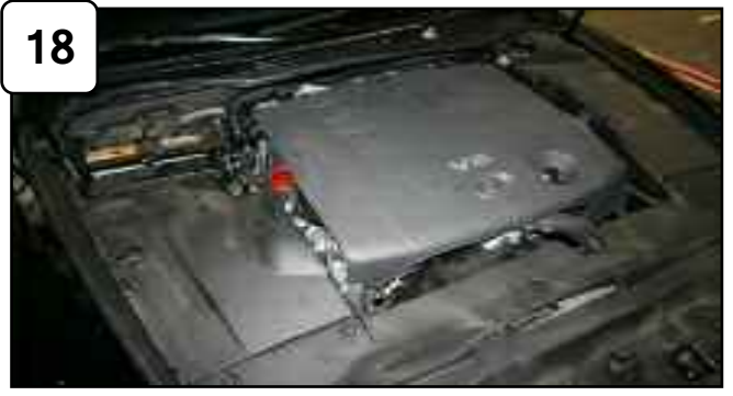
The installation of <u>your Takeda performance intake</u> is now complete. Please check all components and retighten if necessary. Thank you for choosing Takeda!

Looking for performance air intake systems? Visit our website.