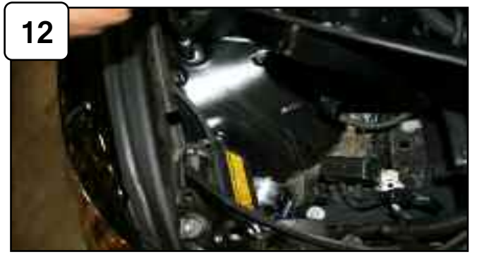
Secure housing using provided screws and flat washers and tighten using 10mm socket or wrench.