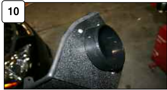
Attach adaptor to housing using button head screws provided. Attach trim seal to top of housing and cut out for scoop.