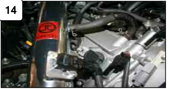
Re-connect MAF sensor harness and crank case line.