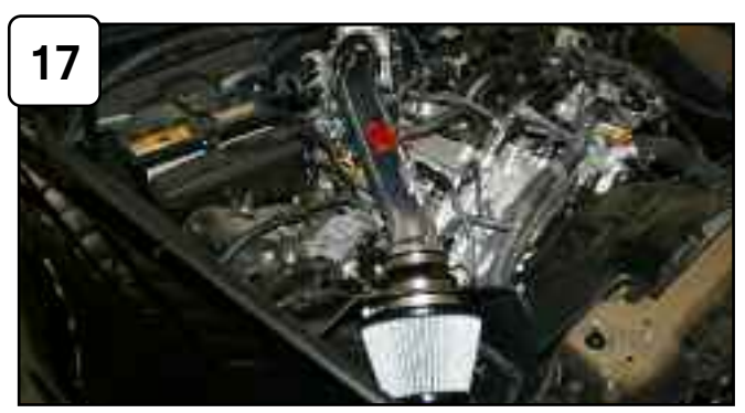
Re-install all engine covers. (Intake is shown with no plastic covers on)