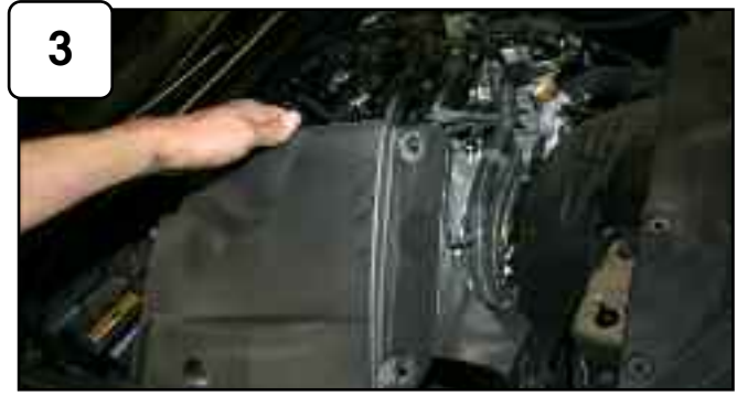
Remove engine cover and front/passenger plastic covers.