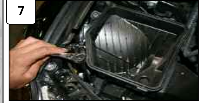
With 10mm socket or wrench loosen the 2 bolts holding in bottom half of air box and remove.