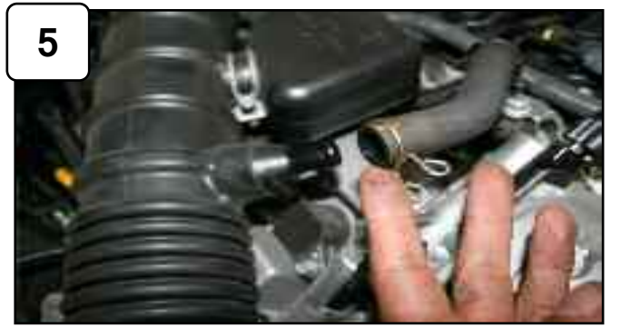
Remove crank case line from stock intake tube.