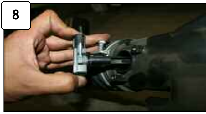
Remove MAF sensor using phillips screwdriver.