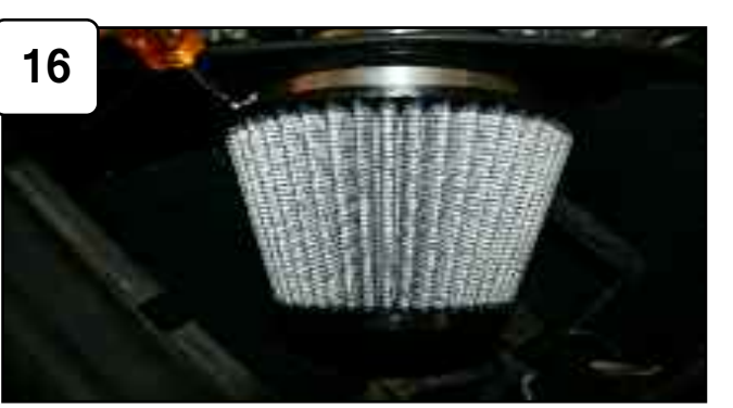
Install air filter and tighten using 5/16" nut driver.

Pro Dry S ™ cleaning: see cleaning instruction sheet TF-9000I.