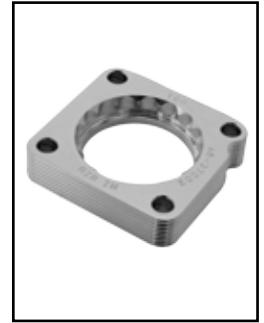
Throttle Body Spacer