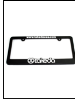
Lic. Plate Frame

P/N: 49-36609 *Fits EX-L Coupe V6 Models Only