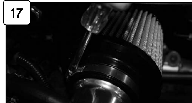
17 Attach air filter to tube and tighten using 5/16" nut driver. Re-connect battery terminals.