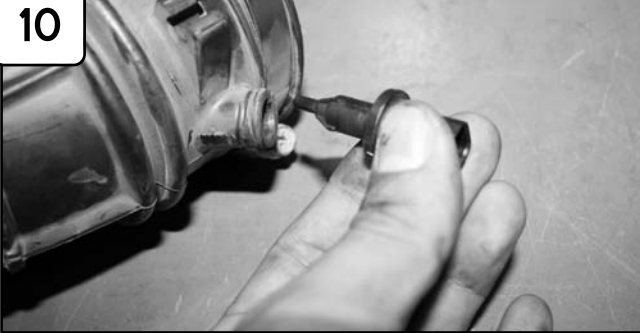
10 Remove temp sensor from stock intake tube.

Pro Dry S™ cleaning: see cleaning instruction sheet TF-9000I.