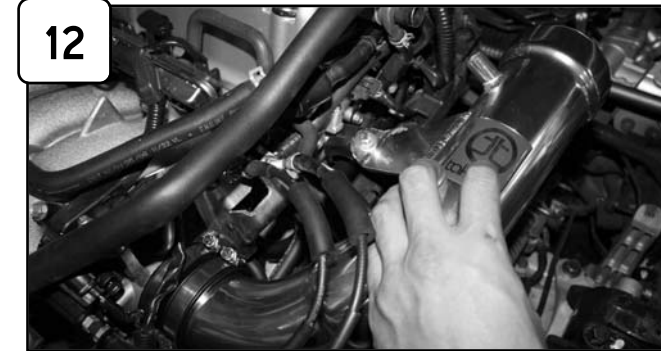
12 Install intake assembly and position. Do not tighten.