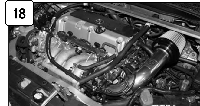
18 The installation of your Takeda performance intake is now complete. Please check all components and re-tighten if necessary. Thank you for choosing Takeda!