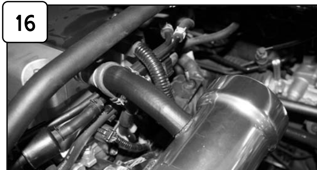
16 With provided 5/8" hose connect to engine and tube.