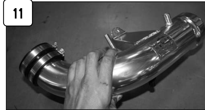
11 Attach coupler to tube using clamps provided. Do not tighten. Install grommet to hole on tube.