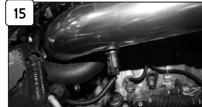
15 Install temp sensor to grommet on tube and connect sensor harness.