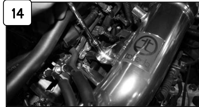
14 Secure tab on tube to engine. Tighten using provided screw and flat washer.