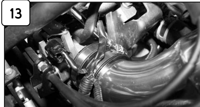
13 Tighten clamps using 5/16" nut driver.