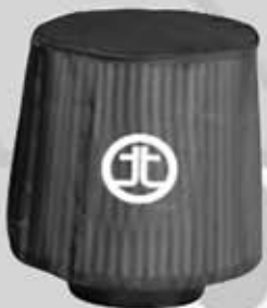
Pre Filter P/N: TP-7011B

Note: Filter Cleaning: When cleaning your Pro Dry 5 ™ filter, be sure to use only "Restore Kit" (Takeda P/N: TP-7015C Pro Dry 5 ™ cleaner only.)