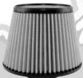
Replacement Filter P/N: TF-9003D