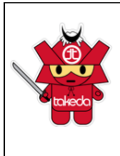
Takeda Mascot Decal

P/N: 40-30332 (M) 40-30333 (L) 40-30334 (XL)