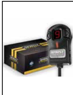
Sprint Booster V3