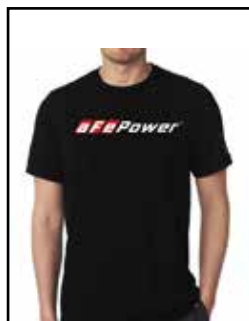
aFe POWER T-Shirt

P/N: 40-30441-B (S) 40-30442-B (M) 40-30443-B (L)