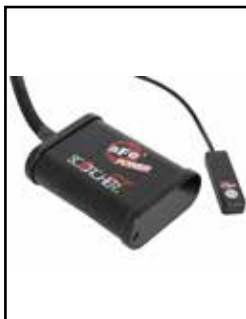
SCORCHER GT Module

P/N: 49-36037-P (Pol. Tips) 49-36037-L (Blue Tips)