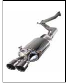
Cat Back Exhaust (Coupe)