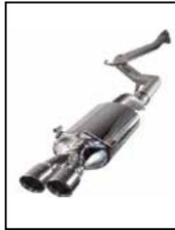
Cat Back Exhaust (Sedan)