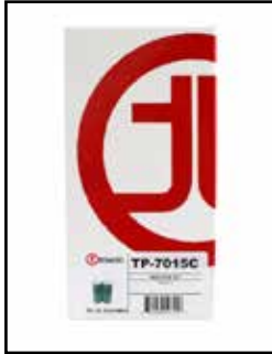
Pro DRY S Restore Kit