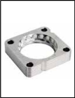
Throttle Body Spacer