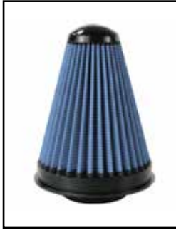
Pro 5R Air Filter