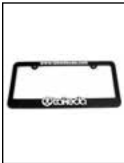
Lic. Plate Frame