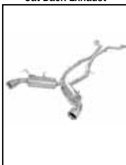
Cat Back Exhaust