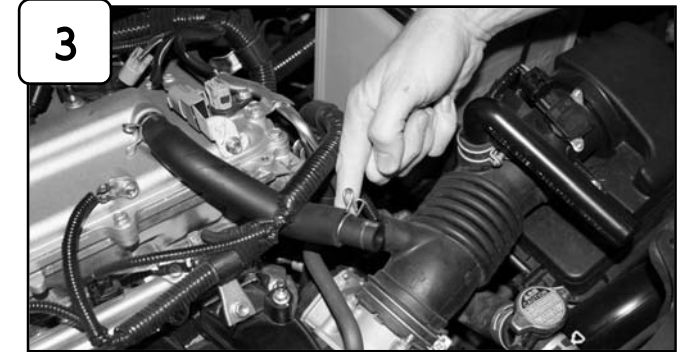
3 Disconnect MAF sensor harness. Loosen clamps using 10mm socket or wrench. Pull crank case line away from tube.