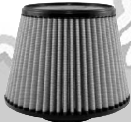
Replacement Filter P/N: TF-9009D