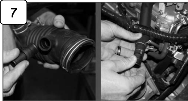
7 Remove factory crank case fitting from stock tube and re-install.