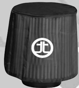
Pre Filter P/N: TP-7011B

Note: Filter Cleaning: When cleaning your Pro Dry S™ filter, be sure to use only "Restore Kit" (Takeda P/N: TP-7016C Pro Dry S™ cleaner only.)