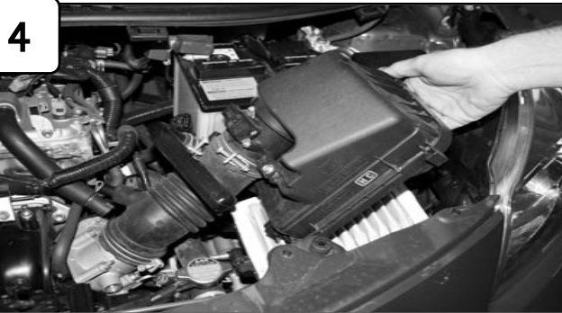
4 Unclip upper half of air box. Remove upper half of stock intake.