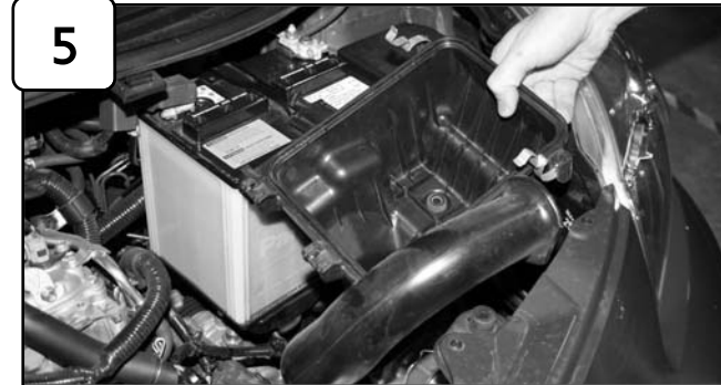
5 With 10mm socket or wrench loosen the 3 bolts holding in bottom half of air box and remove.