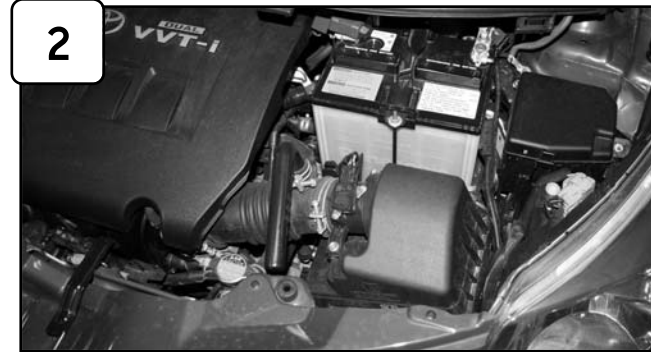
2 Complete Stock intake. Please disconnect battery terminals before installation.