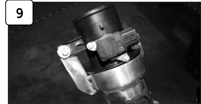
9 Attach MAF sensor to lower intake tube. Make sure gaskets on sensor are completely inside of tube. With provided M6 screw, nut, wavy and flat washers, secure tabs on sensor to intake tube. Tighten using 10mm socket or wrench.