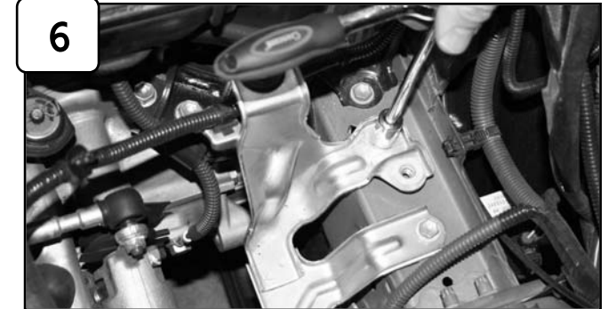
6 With 12mm socket or wrench, loosen air box bracket and remove.