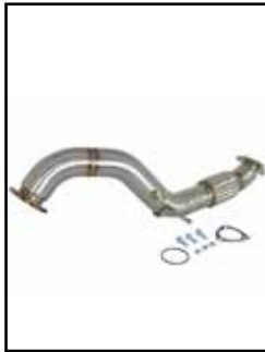
Turbo Middle Race-Pipe

P/N: 48-36606-HC (Street) 48-36606-HN (Race)