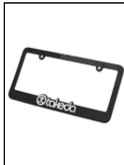
Takeda Lic. Plate Frame