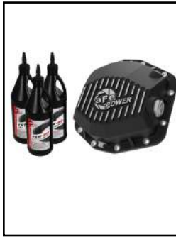
Rear Differential Cover with oil