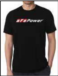
aFe POWER T-Shirt

P/N: 40-30441-B (S) 40-30442-B (M) 40-30443-B (L) 40-30444-B (XL) 40-30445-B (2XL)