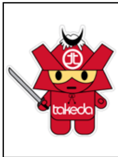
Takeda Mascot Decal

P/N: 40-30331 (S) 40-30332 (M) 40-30333 (L) 40-30334 (XL)