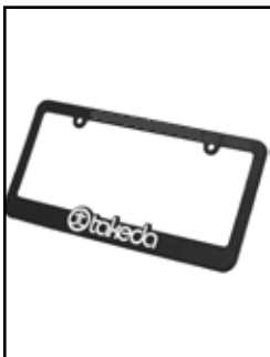
Takeda Lic. Plate Frame