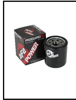
Pro GUARD HD Oil Filter