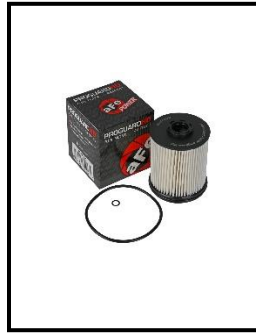
Pro GUARD HD Fuel Filter