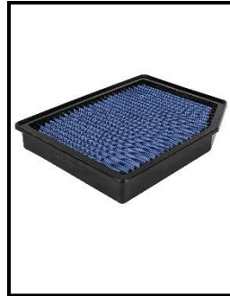
Magnum FLOW Pro 5R Air Filter