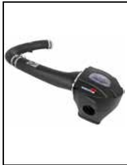
Momentum GT Intake