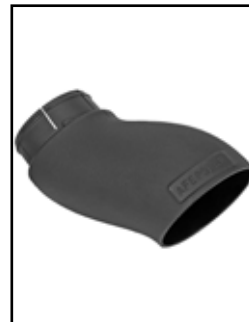
Dynamic Air Scoop