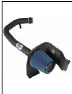
Cold Air Intake System