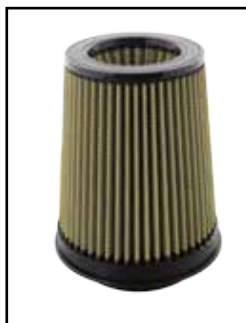
Pro-GUARD 7 Air Filter