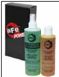
Gold Squeeze Restore Kit