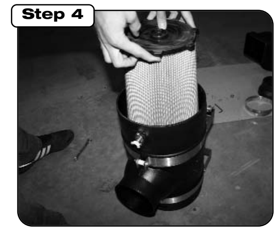
Install filter into canister and tighten using 5/16" nut driver. (Use cut out slots to tighten.)