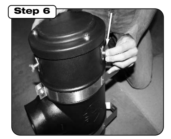
Line up cover clips to Dzus fasteners and secure cover.