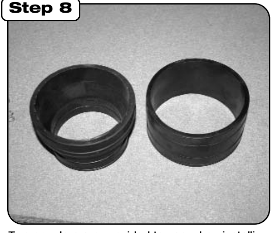
Two couplers are provided to use when installing your canister. (Your choice of what size to use) Check all hoses, clamps and connections periodically. Thank you for choosing aFe!