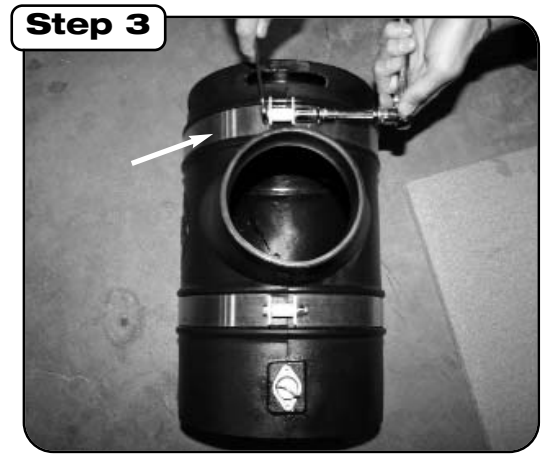
With 10mm socket or wrench, tighten down band clamps with hardware provided. Use 1 flat, 1 lock washer per screw ( Make sure nylon spacer is between clamp to keep from collapsing.)

Install button head screws and wavy washers through canister with 5-1/2" adapter.