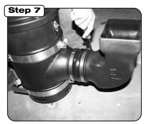
Install your snorkel with hump coupler and clamps and tighten. ( Snorkel and band clamps can be adjusted )