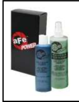
Pro 5R Restore Kit