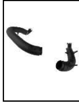
Turbo Inlet Pipes