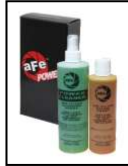
Pro GUARD 7 Restore Kit