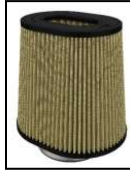
Pro GUARD 7 Air Filter