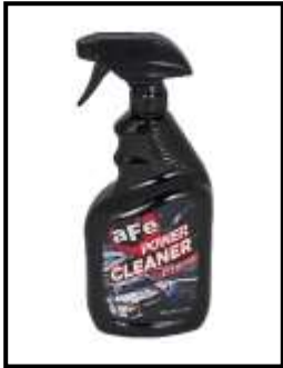
Power Cleaner for Oiled air filter