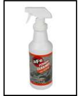
Power Cleaner for Pro Dry S