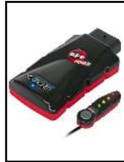
SCORCHER Blue Power Module