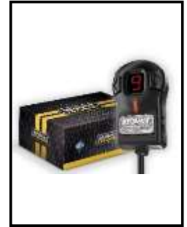
Sprint Booster V3