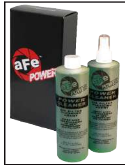
Pro DRY S Restore Kit