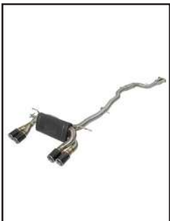
DP-Back Exhaust System

P/N: 49-36337-C (C/F Tips) 49-36337-P (Pol Tips)