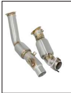
Twisted Steel Downpipes

P/N: 48-36312-1 (Street) 48-36313 (Race)