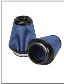
Pro 5R Air Filter