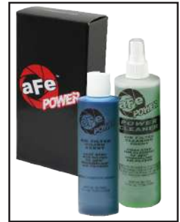
Blue Squeeze Restore Kit