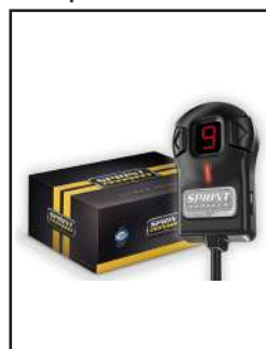
Sprint Booster V3

P/N: 49-36338-C (C/F Tips) 49-36338-P (Pol Tips)