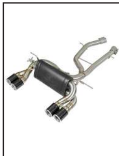
Axle-Back Exhaust System

P/N: 49-36338-C (C/F Tips) 49-36338-P (Pol Tips)