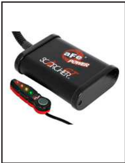
SCORCHER GT Module