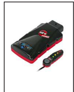
SCORCHER BLUE Module