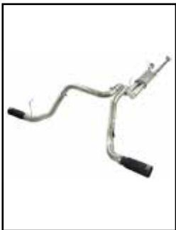
Dual Cat-Back Exhaust

P/N: 49-46014-B (Blk Tips) 49-46014-P (Pol Tips)