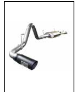
aFe Cat-Back Exhaust