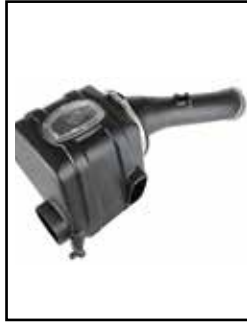
Cold Air Intake System

P/N: 49-46014-B (Blk Tips) 49-46014-P (Pol Tips)