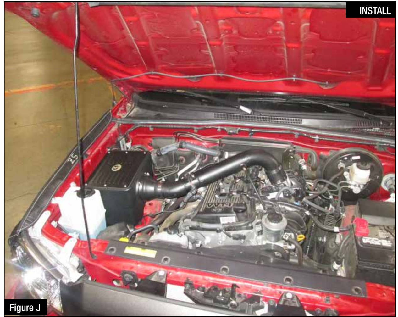
Refer to Figure J for Steps 18-19

Step 18: Check and adjust intake tube as needed and tighten all coupler clamps.