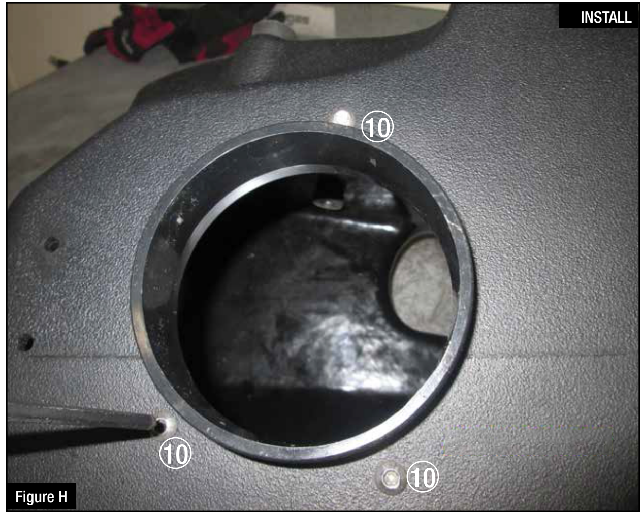
Refer to Figure H for Step 12