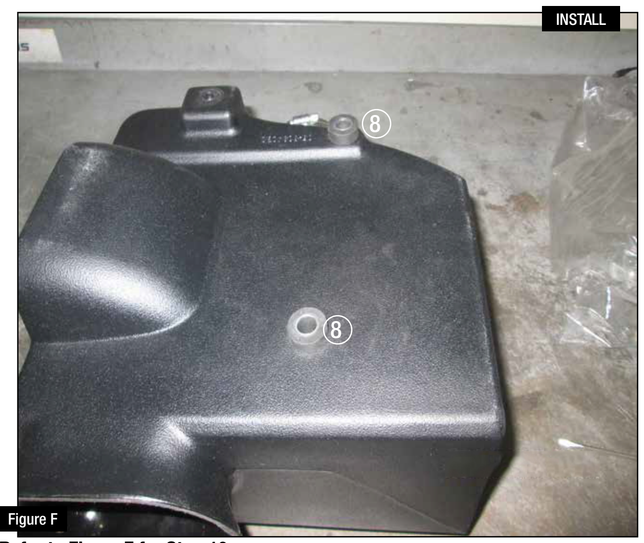
Refer to Figure F for Step 10