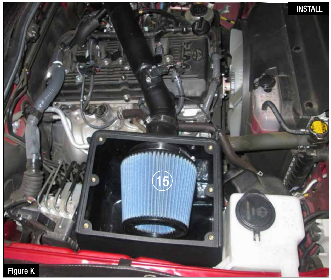
Refer to Figure K for Step 17

Step 17: Place high-flow filter into housing (15) and tighten using 8mm nut driver. Place cover on housing using M6 button head screws provided and tighten using 4mm allen wrench.