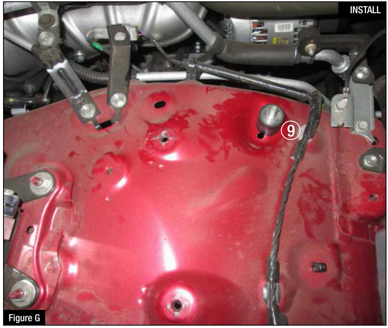
Refer to Figure G for Step 11