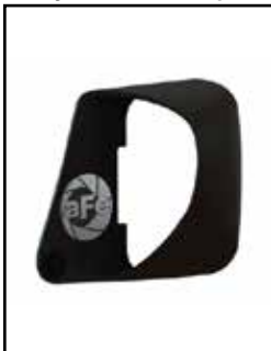
Dynamic Air Scoop