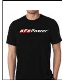
aFe Motorsport T-Shirt

P/N: 40-30442-B (M) 40-30443-B (L) 40-30444-B (XL)