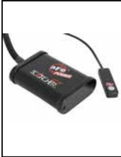
SCORCHER GT Module