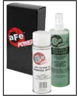
Blue Aerosol Restore Kit