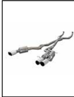
aFe Cat-Back Exhaust