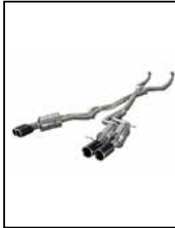
aFe Cat-Back Exhaust