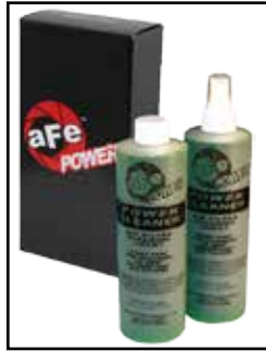
Pro DRY S Restore Kit