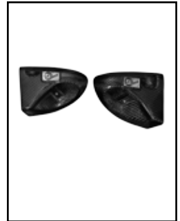
Dynamic Air Scoops