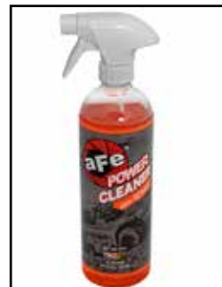
Dry Filters Cleaner Spray