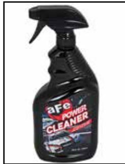
Oiled Filters Cleaner Spray