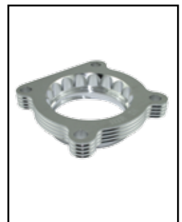
Throttel Body Spacer