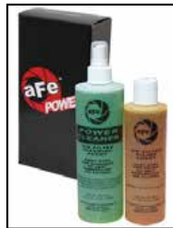
Gold Squeeze Restore Kit