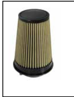
Pro GUARD 7 Air Filter