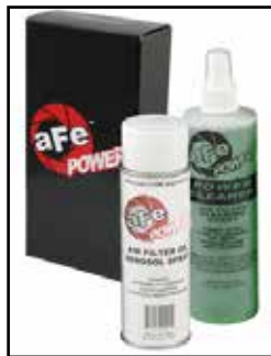
Gold Aerosol Restore Kit