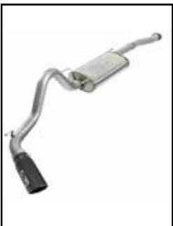
Cat-Back Exhaust System

P/N: 49-46026-B (Blk Tip) 49-46026-P (Pol Tip)