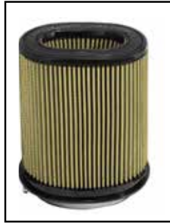
Pro-GUARD 7 Air Filter