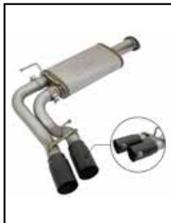
Side-Exit Exhaust System

P/N: 49-46032-B (Blk Tips) 49-46032-P (Pol Tips)