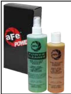
Gold Squeeze Restore Kit