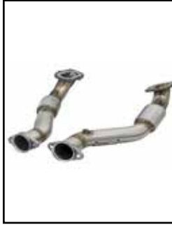
Exhaust Connection Pipes

P/N: 48-34130-YC (Street) 48-34130-YN (Race)