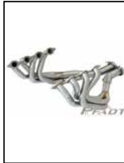
PFADT Long Tube Headers