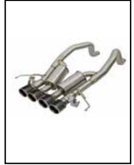
Axle-Back Exhaust System

P/N: 49-34082-C (C/F Tips) 49-34082-P (Pol. Tips)