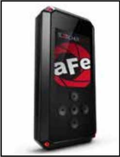
SCORCHER PRO Programmer