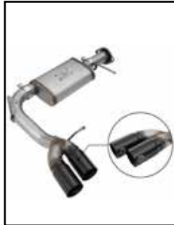
Side Exit Exhaust

P/N: 49-44061-B (w/ Blk Tip) 49-44061-P (w/ Pol Tip)