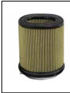
PRO GUARD 7