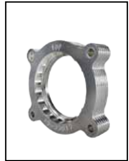
Throttle Body Spacer