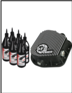
Rear Differential Cover