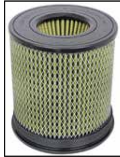
Pr-GUARD 7 Air Filter