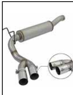
Rebel Series Exhaust

P/N: 49-42057-B (Blk. Tips) 49-42057-P (Pol. Tips)