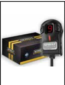
Sprint Booster V3

P/N: 49-42056-B (Blk. Tip) 49-42056-P (Pol. Tip)