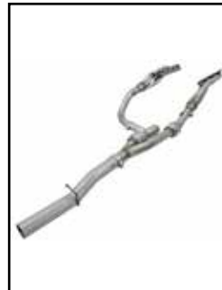
Headers w/ Connection Pipes

P/N: 48-42013-YC (Street) 48-42013-YN (Race)