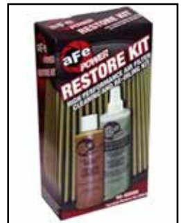
Gold Squeeze Restore Kit