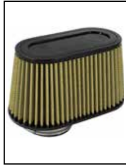
PRO GUARD 7 Air Filter