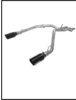
DPF Back Exhaust