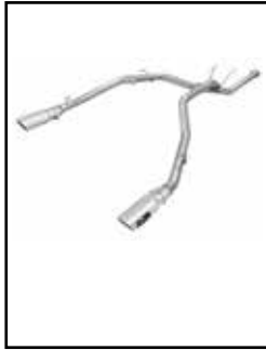
DPF Back Exhaust