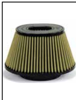
Pro Guard 7 Air Filter