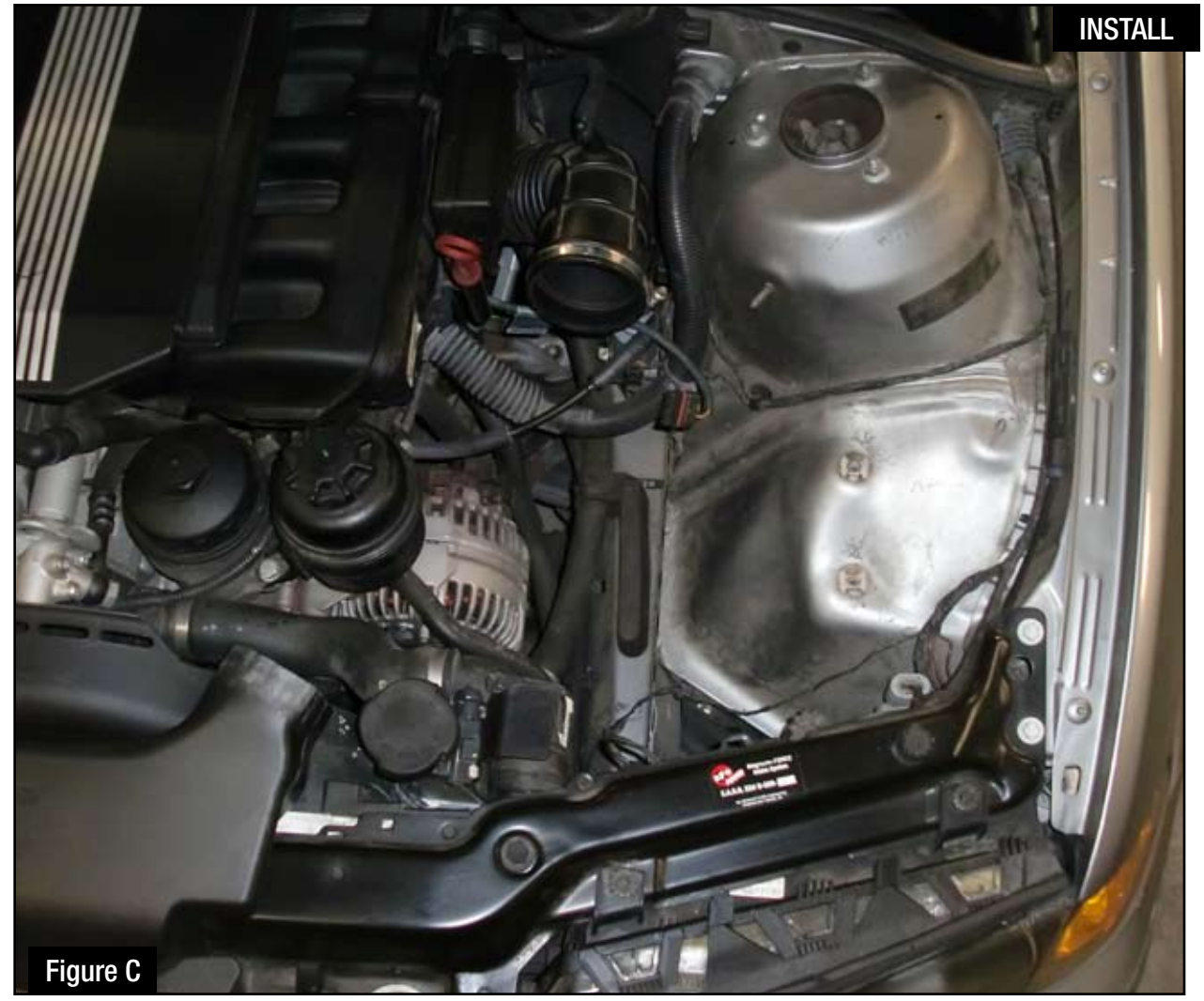
Refer to Figure C for step 9

Step 9. With everything removed you are now ready to install the aFe intake.