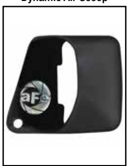
P/N: 54-12218 (Black) 54-12218-C (Carbon Fiber) 54-12218-L (Blue) 54-12218-R (Red)