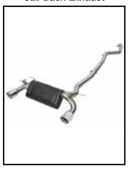
P/N: 49-36334-P (Pol. Tips) 49-36334-B (Blk. Tips)