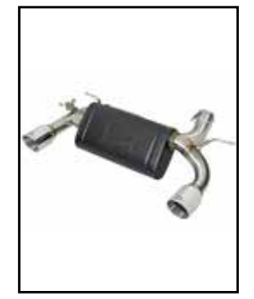
P/N: 49-36335-P (Pol. Tips) 49-36335-B (Blk. Tips)