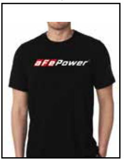
P/N:40-30442-B (M) 40-30443-B (L)