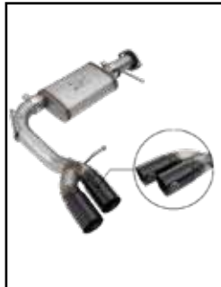
Rebel Exhaust System

P/N: 49-44058-B (Blk Tips) 49-44058-P (Pol Tips)