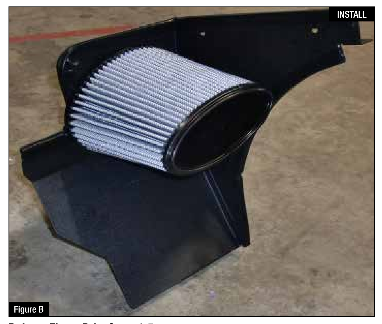
Refer to Figure B for Steps 6-7

Step 6: <u>Install aFe filter onto the aFe housing</u>. Make sure housing is sealed in filter retention groove.