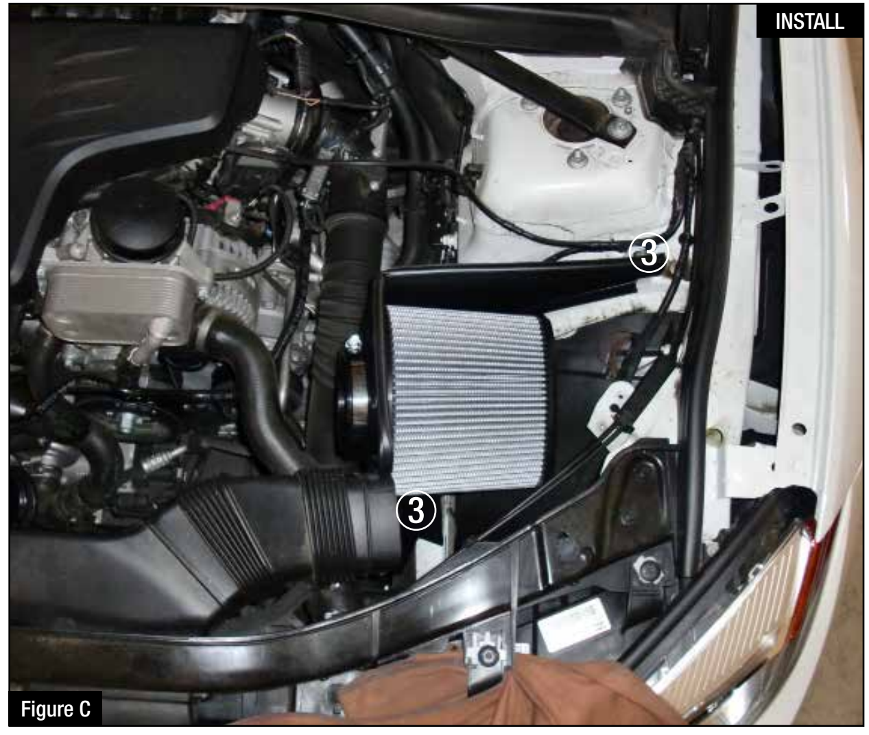
Refer to Figure C for Step 8

Step 8: Install aFe housing into vehicle, secure it with with the supplied nut, washers and bolts 3.