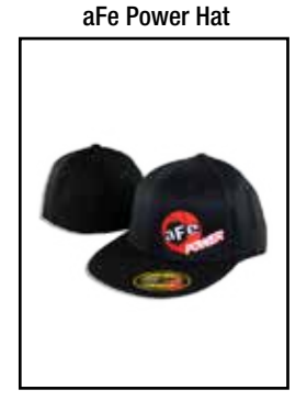
P/N: 40-10114 S/M P/N: 40-10115 L/XL