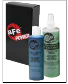
Blue Squeeze Restore Kit