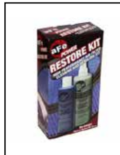
Pro 5R Restore Kit Squeeze