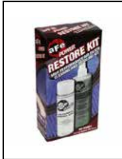
Pro 5R Restore Kit Aerosol