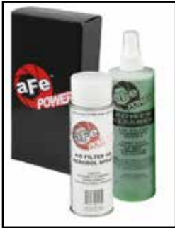
Blue Aerosol Restore Kit