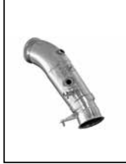
Twisted Steel Header