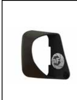
Dynamic Air Scoop