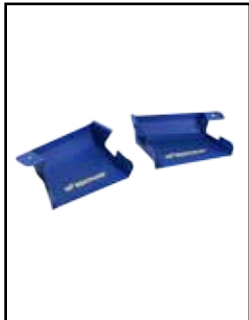
Dynamic Air Scoop