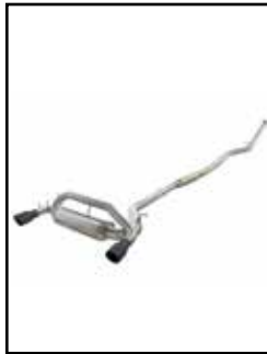
304 SS Cat-Back Exhaust