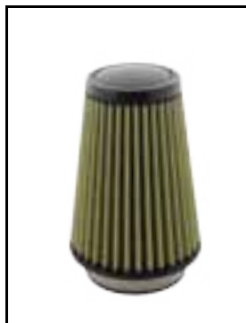
Pro-GUARD 7 Air Filter