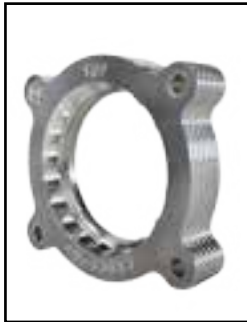
Throttle Body Spacer