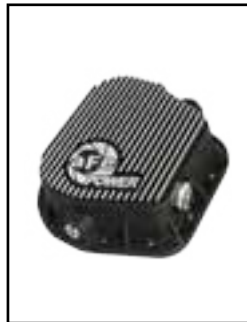
Pan and Covers